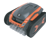
VORTRAX TRX 8500 iQ