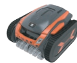
VORTRAX TRX 7500 iQ